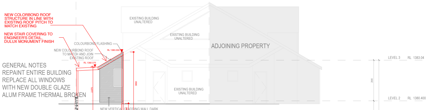
02 SOUTH ELEVATION SCALE 1:100 @ A3